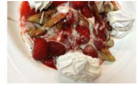
French Toast Heaven