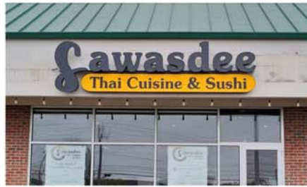
Sawasdee Thai Cuisine