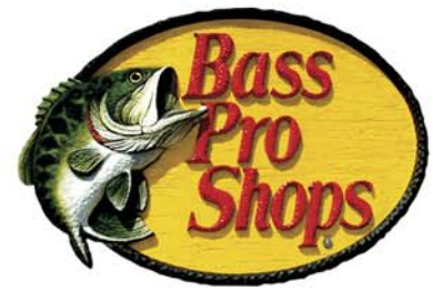
Bass Pro Outdoor World