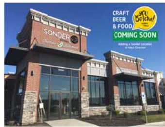
Sonder Taphaus & Kitchen