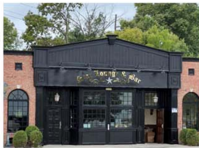
Star Lounge & Bar