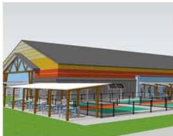
The Pickle Lodge