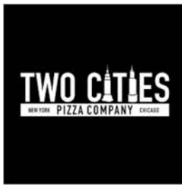
Two Cities Pizza