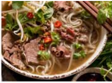
Vietnamese Noodles & Sandwiches